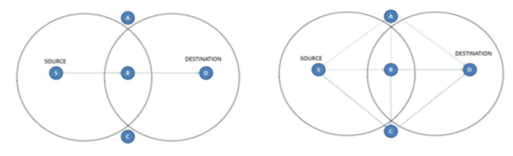
Figure 2: ODL Rule

The On-Demand Learning rule is used to maintain the exact position of the node within the network. It helps the nodes to respond its neighbor node on the forwarding path [12].