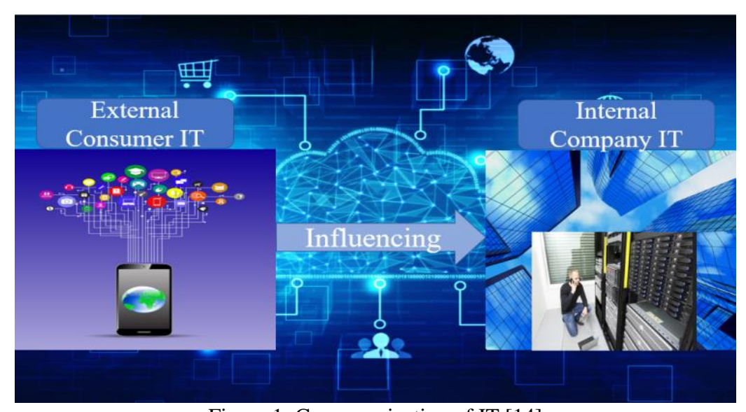
Figure 1: Consumerization of IT [14]

What makes IT consumerization unsettling to some corporate leaders is that it signifies a shift in the control of information. As shown in Fig. 1 [7], IT consumerization phenomenon will have serious consequences on IT department. Changes introduced by IT consumerization are redefining the role of IT. Some claim that as technology is easier to consume and provided in a self-service manner, the role of IT department goes away or IT department becomes irrelevant. IT consumerization is not replacing IT department but reducing the demand for IT services and freeing up IT staff to perform more complicated tasks. The professionals in the IT workforce have been advised to adjust to a culture of increased IT consumerization [8].