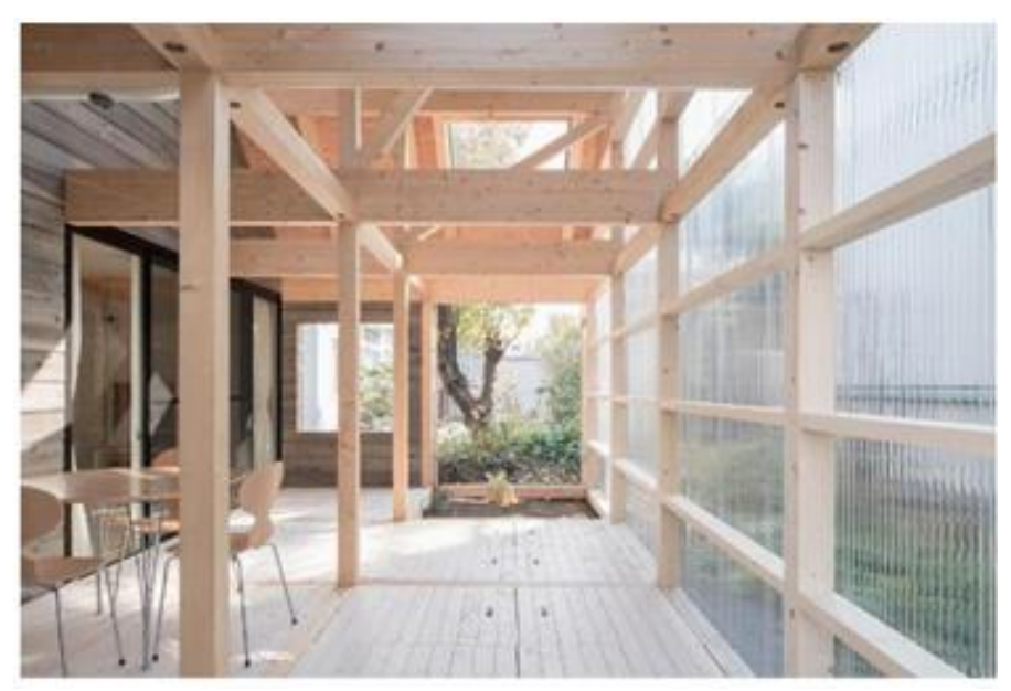
Figure 3: House in Shinkawa / Yoshichika Takagi