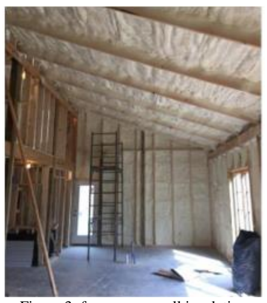
Figure 3: foam spray wall insulation

like pipes' and cables' insulation, storage tanks, skylights, roofing, windows and doors, insulation and temporary structures can be made entirely, partly or as a bonding compound in new material mixes like WPCs- wood-plastic composites, carbon or natural fiber reinforced plastic. Material of this study has a vast application in the field of tensile structures construction or tents in smaller scale. One of the most common uses of plastic in the building construction is insulation of large surfaces such are walls, roofs or floors that can come in different forms-commonly in foam which amounts can be adjusted to fit any forms, in a prefabricated form like SIP panels. As well as to securely insulate smaller details like pipes or cables, it is frequently used in the tiling of the exterior building planes too (Hopewell J; Dvorak R & Kosior E 2009, p.1-2).