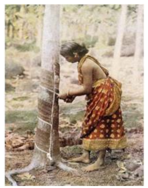
Figure 1: A woman in Sri Lanka harvesting rubber. 1920

and how it has surpassed most other man-made materials In the further research, the relationship between plastic and its user within the sphere of construction will be investigated.