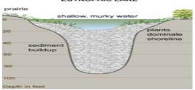
Figure 2: trophic states of lakes