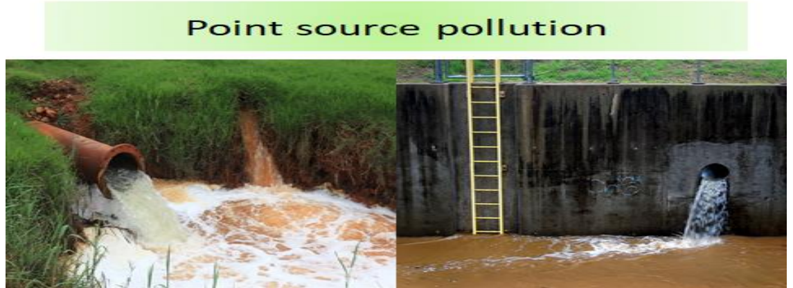
Figure 3: Point source pollution.

Eutrophication is the process of excessive nutrient enrichment of waters that typically results in problems associated with, algal or cyanobacteria growth[14].Man-made sources causing eutrophication can be divided into two types:-Point Source contamination (Fig.3) comes from a single and defined source, such as industrial waste water ,waste water treatment plant ,discharge of municipal waste water, and among the point source loadings the largest loading is domestic wastewater which contain 33% COD , 34% nitrogen and 45% phosphorus because of large amount of detergent in their content . A Non-Point Source (Fig.4) comes from a wide variety and undefined sources such as: - Agricultural runoff and animal wastes Urban and suburban runoff, atmospheric deposition, forestry and mining operation, marinas and boating activities and coastal wastes [15].