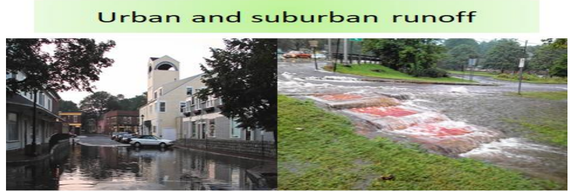
Figure 4: Non-point sources