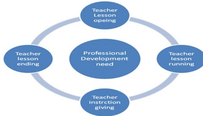
Figure 1 Teacher professional development needs areas