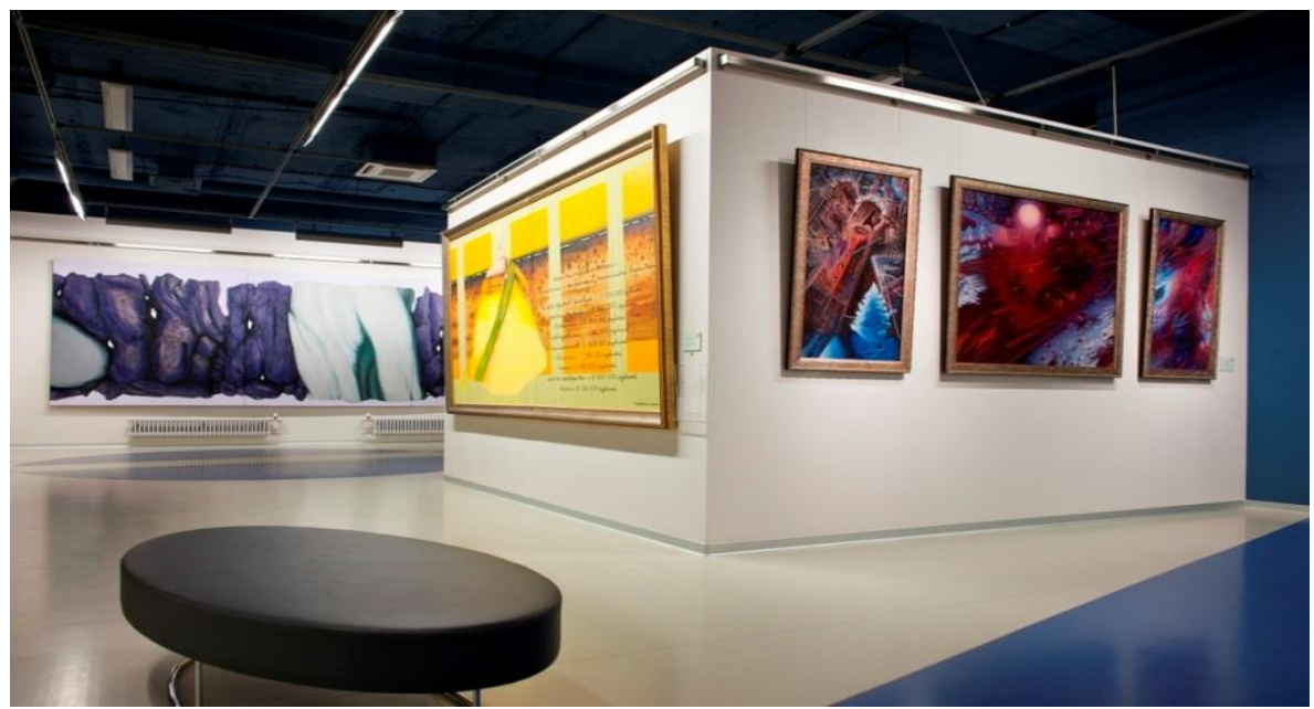
Figure 3: Example of creation of an island exhibition layout

Given these scenarios, it becomes possible to develop unique images of art centre buildings that will enhance the visitors' experience. It is also possible to define the main conceptual approaches to the design solutions for the exhibition space in art centres in Ukraine: