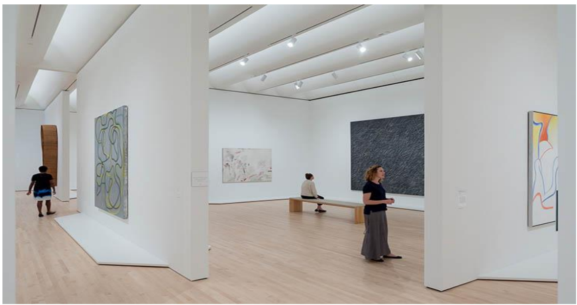
Figure 2: Example of arrangement of paintings for various purposes.