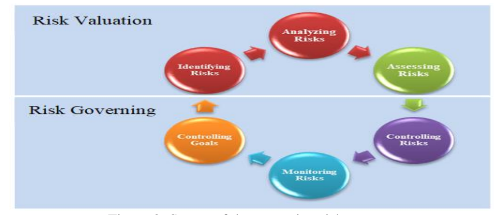
Figure 2: Stages of the managing risk process

The risk potential analysis of a project states to what extent project risks influence the risk situation of the enterprise. Risk potential should be estimated without a detailed consideration of the individual risks at as little expense as possible (Vyas&Raol, 2017). Depending on the assessment of the risk potential, the risk management process is set in motion (Nocco&Stulz 2006; De Bakker et al., 2010). Managing risk process comprises the integration of basic principles of risk policy, the establishment of a risk-consciousness as well as the organizational integration. It is an impetus for the risk management and is responsible for the control of risks in full knowledge of the current risk situation (Schieg, 2006; McManus, 2012). Through the managing risk process, transparency increases, many problems can be avoided from the outset through proactive action, the project can be prepared for unavoidable problems. Through this, the consequences can be mitigated, and the project manager retains the control over the project (Richardson et al., 2009; Sparrow, 2011; Vyas&Raol, 2017). Thus, the risk management process consists of stages represented in Figure 2 that have a direct impact on successful construction project management, which will be discussed in the following paragraphs.