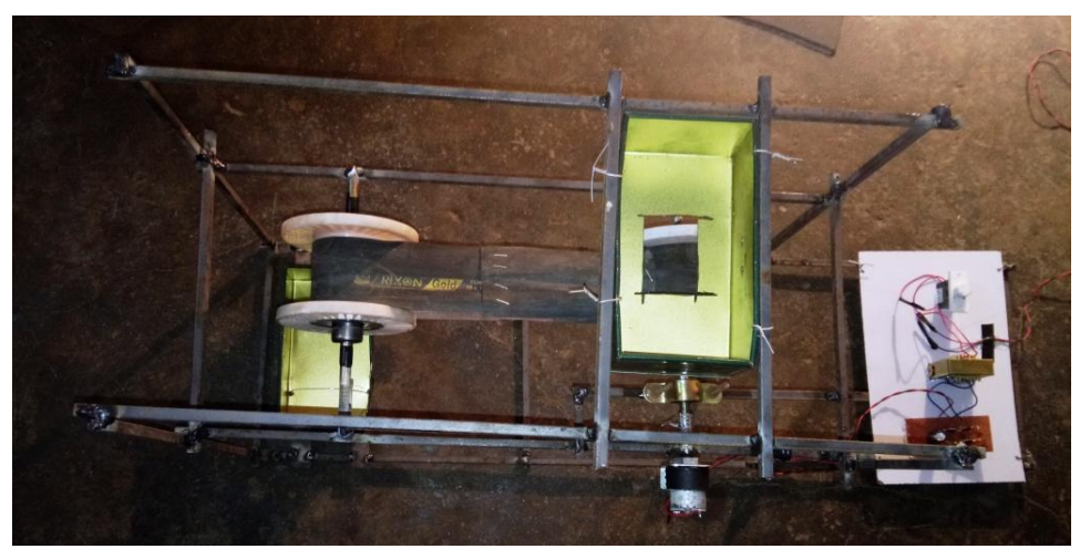
Figure 1: Experimental setup

The flat belt consists of more layers of material to provide the linear strength and shape, the materials flowing over the moving flat belt with speed. Belt conveyor technology was also used in conveyor transport system such as many manufacturing assembly lines. Belt conveyors were the most commonly used in power conveyors because of they are the most versatile and the least expensive. These conveyors system used the highest quality premium belting products, which reduces the belt stretch and results in less maintenance by tension adjustments.