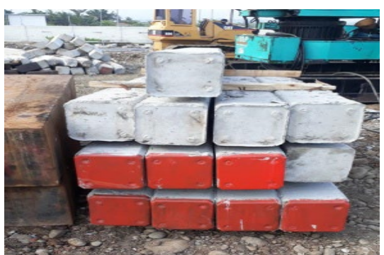
Figure 3 Placing Pile Foundation Materials Near the Pile Point

2) Placing pile foundation materials at the nearest location from pile point Figure 3