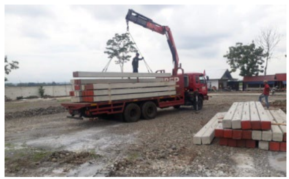
Figure 2 Bring in the Materials of Pile Foundation

2) Placing pile foundation materials at the nearest location from pile point Figure 3