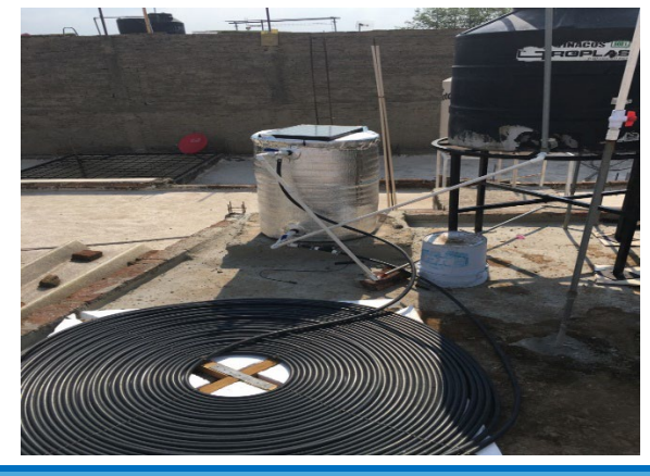
Figure 5 Solar Water Heaters

The third and final form of solar energy production has essentially one purpose, to generate electricity using solar energy as the fuel input. STPPs are beneficial but inefficient. Solar energy seems to be trending toward smaller, individual applications using PV cells rather than the traditional power plant applications.