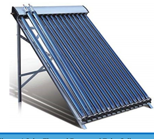
Figure 4 Solar Thermal Evacuated Tube Collector

efficiency commercial product in Figure 4. SHC can also be used for cooking. This is perhaps the oldest use of solar energy. For hundreds of years, people have been using the power of the sun to cook with. Although a simple concept, the technology has been refined in recent years to be more sanitary and efficient. Figure 4