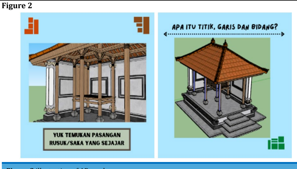
Figure 2 illustration of AR marker

Development of Augmented Reality Based Geometry Learning Media Oriented to Balinese Architecture to Improve Ability Student Mathematics Spatial