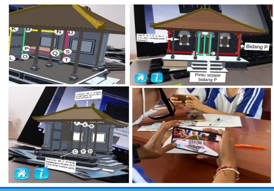
Figure 3 illustration of scan AR

The designed AR learning media was then analysed according to the design research stages. The results of the analysis by validators on AR and Lesson Plan of media are summarized as follows: