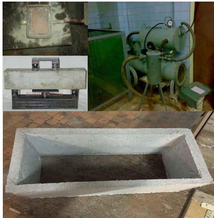
Figure 1: Laboratory equipment for sample preparation by method vibrovacuumizing

In the Kharkiv National University Civil Engineering and Architecture carried out a study on the use of a magnesia binder for manufacturing specimens. There were two types specimens were prepared two specimens were casting by vibration and two specimens by vibrovacuumizing. Specimens details 20×60×40 cm with hollow section 17×57×40, humidity of the mixture (W/C) was used in the range of 0.8. The apparatus of test samples is shown in figure 1.