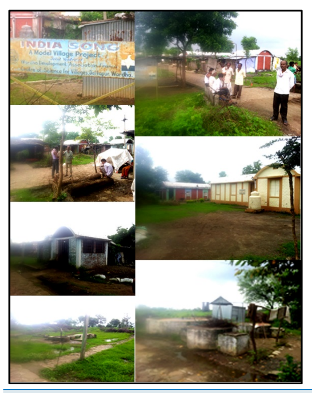
Figure 4 Outdoor spaces in Community, Kanhapur