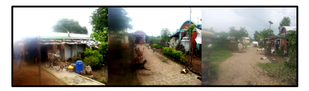
Figure 5 Unplanned spaces in community, Kanhapur