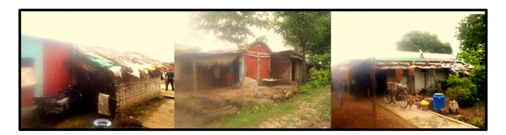
Figure 3 Extensions added to the houses in the community, Kanhapur