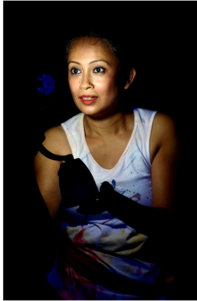
Figure 3 Close Visual Frame of the Performer in Dark Theatrical Lighting.