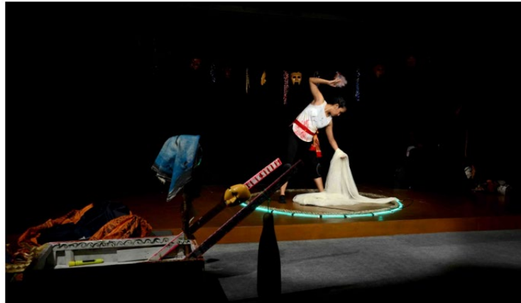
Figure 2 Circular Illuminated Stage with Masks, Props and Performer-Object Relation.

The silver sphere that becomes an eye is another significant sign. At first it appears as a playful object. Later, when the silver foil is removed, it becomes an eye. This transformation matters for a paper on documentation. The eye suggests seeing, watching and being watched. In recorded theatre, there is also another eye: the camera. The play therefore moves between the stage-eye and the camera-eye.