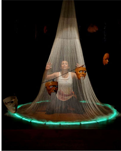
Figure 1 Performer Framed within the White Net-Like Scenic Structure.

Sequence 3 widens the question of labour. The narrator recalls that Eréndira was washer woman, cleaning woman, cook, gardener, bath giver, hairstylist and pet caretaker (Goswami & Sarma, n.d.). This list is important because it shows that exploitation is not only sexual. It is also domestic, emotional and economic. The performance connects the female body with unpaid work, debt and obedience.