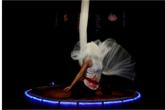
Figure 4 Movement with White Fabric/Net Suggesting Struggle and Transformation.