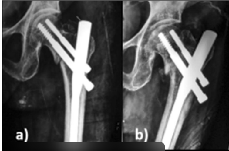
Figure 1 X-ray Showing an Intertrochanteric Fracture of the Femur in an Elderly Patient., Figure 1a: Post-Operative X-ray Showing Fixation with a Dynamic Hip Screw (DHS), Figure 1b: Post-Operative X-ray Showing Fixation with a Proximal Femoral Nail (PFN).