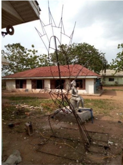
Plate 1 Armature Construction Dimension: 275 Cm Diameter X 244 Cm High Medium: Metal Rods, Chicken Wire and Binding Wire Year: 2021