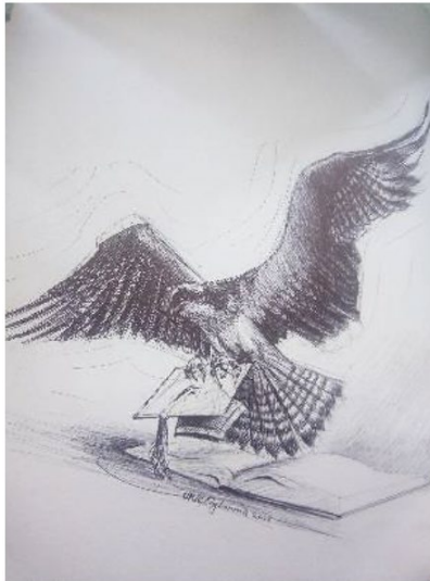
Figure 1 Drawing of the Conceptual Eagle. Medium: Ink On Paper Year: 2021 Artist: Ukie Ogbonna