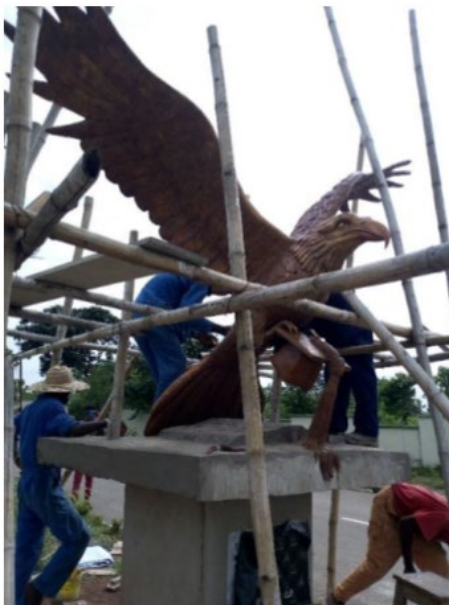
Plate 5 Improvised Scaffolds Construction Around the Conceptualised Eagle for Easy Accessibility and Proper Finishing Dimension: 275 Cm Diameter X 244 Cm High Medium: Bamboo, Cement, Sand, Mild Steel Rods, Chicken Wire and Binding Wire Year: 2021