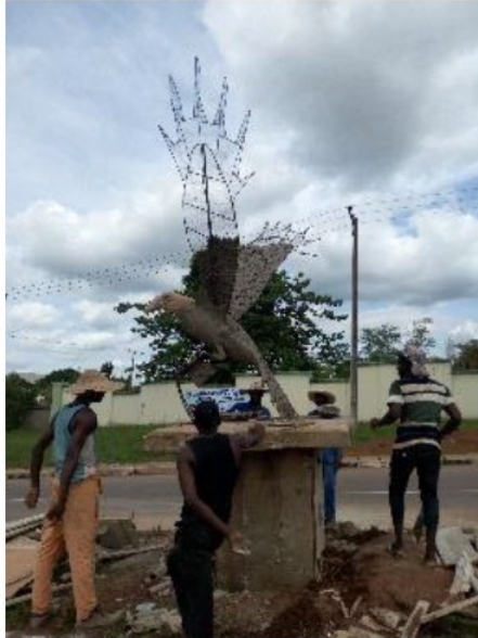
Plate 4 Gradual Buildup and Application of Mortar on the Constructed Armature Dimension: 275 Cm Diameter X 244 Cm High Medium: Cement, Sand, Mild Steel Rods, Chicken Wire and Binding Wire Year: 2021 Source: Ephraim Ugochukwu