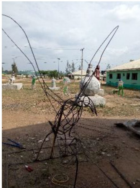
Plate 2 Armature Construction Dimension: 275 Cm Diameter X 244 Cm High Medium: Metal Rods, Chicken Wire and Binding Wire Year: 2021