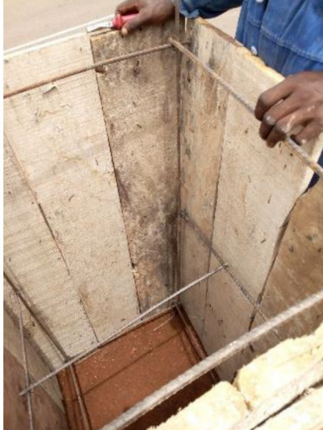
Plate 3 Armature Construction Dimension: 275 Cm Diameter X 244 Cm High Medium: Plywood, Metal Rods and Binding Wire Year: 2021