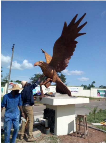
Plate 6 General Finishing and Application of Patina Dimension: 275 Cm Diameter X 244 Cm High Medium: Cement, Sand, Mild Steel Rods, Chicken Wire and Binding Wire and Paint Patina Year: 2021 Source: Ephraim Ugochukwu