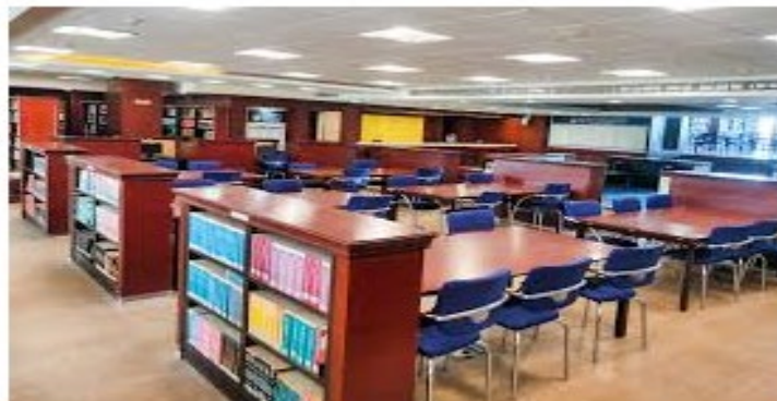
AMITY UNIVERSITY LIBRARY, LUCKNOW

Library at Amity University Lucknow consist of Reference section, Circulation section, Periodical section, Conference room, Meeting room, Carrels, Group Discussion rooms, Audio Visual rooms, Cubicles and internet surfing terminal. The library is open to from 9.00 A.M. till 8.00. P.M. and on Sunday 8.00A.M till 4.00 P.M., National holiday closed.