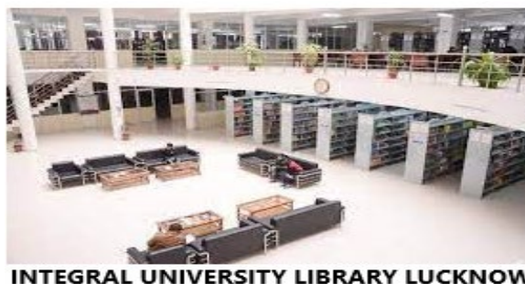
INTEGRAL UNIVERSITY LIBRARY LUCKNOW

The Integral University library is one of the largest library among all private University libraries at Lucknow which has a very vast collection of documents. The library has holdings in various subjects likewise science, technology, social science, engineering, computer science, management, biotechnology, medical science and allied and so on. The integral central library is open to all teachers, non-teaching staff, researchers as well as students. The library has well qualified 25 professional library staff. The central library of this university existence in five storied building. Library is two floors of this multi-story building. Total area of the library 4000 Sq. Mts and total seating capacity is of 550 students. The library is members of various consortium likewise INDEST-AICTE consortium, UGC INFONET consortium. The Integral Central library is open to all users from 9 AM to 8.00 P.M. on all working days, holiday closed.