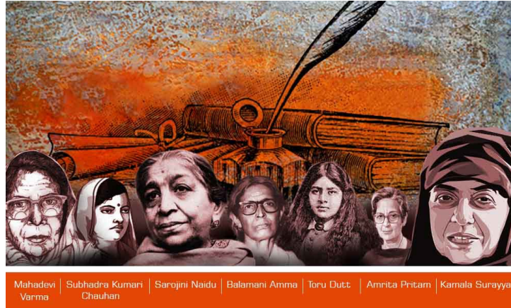
Sources Google: Indian Best Women Poets (Photo: Penguin Books India)