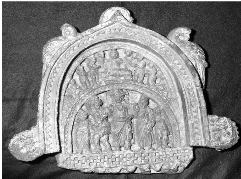
Figure 6 A Grey Chlorite Gothic Relief Panel in the Gandhara Style, Measuring 44 Cm By 37 Cm, Is Thought to Have Been Discovered in Tral, Pulwama.