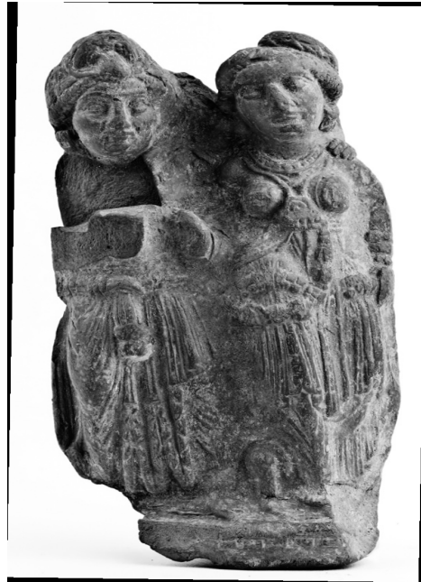
Figure 4 Mithuna Made of Terracotta (10.5 Cm), from Semthan, 1st or 2nd Century CE

A locally fashioned sculpture is the animal capital of Persepolitan kind Figure 5 , evidently mithuna , found at Mamal, near Pahalgam. The head of female has a headscarf or cover over its middle-split hair. The figure's face is missing, but the left hand is mysteriously overextended to the opposite arm, with hand fingers till the rear bull's hump.