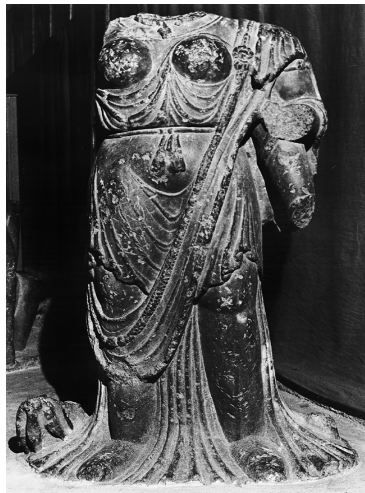
Figure 8 From Bijbihara, Grey Chlorite Fragmented Upright Mahesvari (68 Cm), 5th Century CE.

The vestment on the upper side of the Bijbihara goddess Maheshvari is knotted similarly to the Lakshmi and only just covers the lingering left arms' shoulders. It has