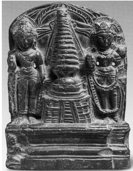
Figure 15 Grey Chlorite Stupa, Personal Acquisition, London (17.3 Cm) Showing Buddha and Tara, 900 CE.

The statue of Durga Mahiṣāsuraṃardini with many hands Figure 16 can be seen in the niche on the wall of the Surya temple at Nadihel Sharma (1993) . Her right leg is depicted on the back of the buffalo and she is seated in ālīḍhāsana . It looks like she holds the tail of the buffalo in her lowest right hand and one of her left hand is holding the demon's hair, and her other hands are holding numerous weapons, including a mace, a lance, a bow and a sword, Pal (2009) .