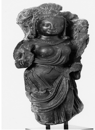
Figure 7 Fractured Grey Chlorite Towering Lakshmi—64 Cm High, From Bijbihara, First Part of the Fifth Century CE.

The standing image Figure 8 is from Bijbihara, portraying the female deity Mahesvari. It appears earlier it had four arms, but the head is missing, and the right and left arms on either side are broken off at the shoulder. It has a big, swollen tummy, broad waist, and enormous, swollen legs. Although it is competent work, it lacks originality and naturalism, and its execution has a heavy, wooden feel. The chiton's folds are arranged in a formulaic pattern. The three-pronged trisula fragments that are still imbedded in the tucks of the robe that stretch outward on the ground to the right of the figure serve as proof that it is Mahesvari. The folds on the other side reveal the remnants of a second unidentified characteristic. The statuette may have fashioned as a portion of a loop of māṭṛcakram - the mother goddess, whom Rajatarāṅgiṇī mentions several times Stein (1900) .