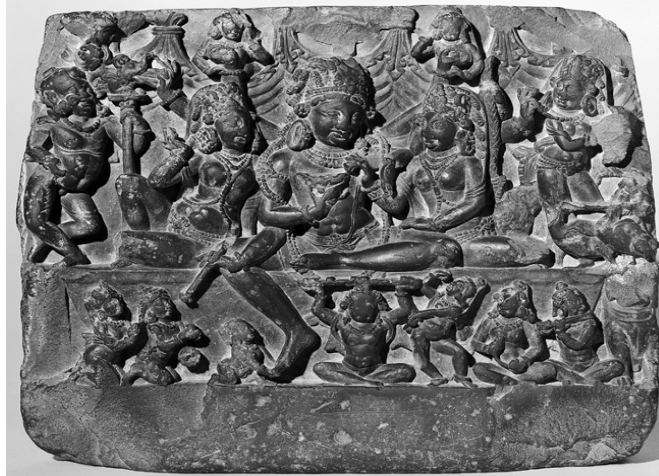
Figure 19 Durga Made of Green Chlorite, 26 Cm Tall, At the Metropolitan Museum of Art, 800 CE.