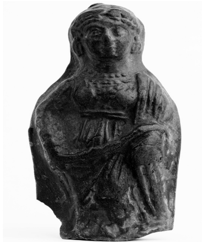
Figure 2 A Personal Acquisition from Semthan, Terracotta Semi-Draped Hellenistic Girl Figure (11.9 cm), 2nd Century CE.