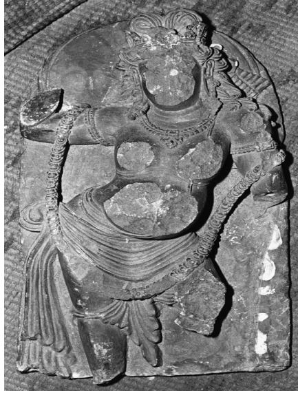
Figure 14 41 Cm High, Fragmented Dancing Mother Goddess in Grey Chlorite, SPSM No. 5016, Mid-700 CE.