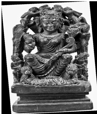
Figure 12 From Baramula, Grey Chlorite Sitting Laksmi Group, 36 Cm High, Possession of the Late Simon Digby Early 7th Century CE.