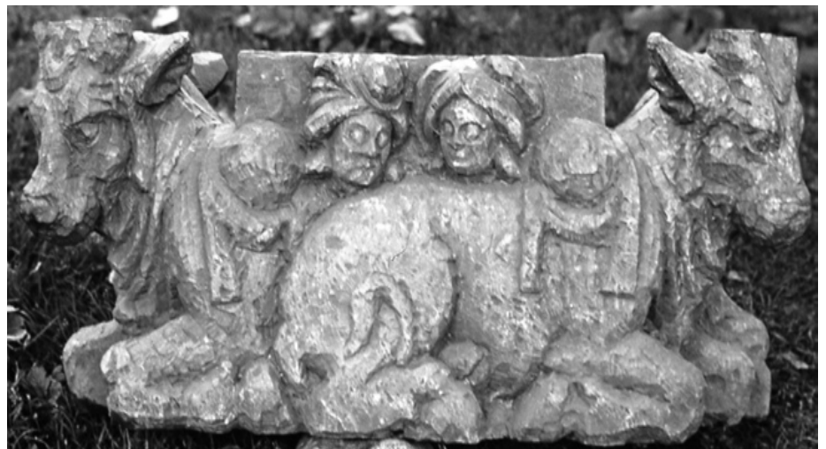
Figure 5 Bull Capital with Greenish-Grey Limestone (87 X 30 X 40 Cm), Mamal (Anantanag), 1st Century BCE- 1st Century CE.

Figure 6 depicts a standing woman in the uncommon scene when Yaśodhara is being offered to Siddhartha by the king's chaplain. Her body is turned away from