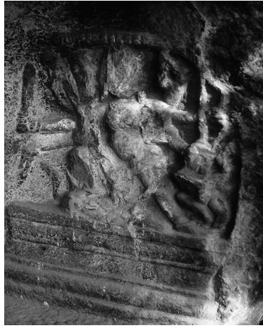
Figure 16 Durga Mahiṣāsūramardīnī's Rock-Cut Relief, At Nadihel, C. 850 CE.

Durga is seated in a chariot with wagons at the margins in this unique sculpture Figure 17 , which has eighteen arms and is from the village of Tengpura Siudmak (2013) and Siudmak (1994b) . The sculpture is around 90 cm high and has been carved from green chlorite. In keeping with the chariot of Surya, Aruna is replaced with a small charioteer. A genuflection contributor with ring circlet, a horn and is incongruously positioned behind the prostrate animal at the proper right. It has a lot of arms, yet it's a well-balanced construction. Sumbha and Nisumbha , the two demons whom she vanquished, are depicted with one of her left hands holding a stressed image round the neck and the other impaled on her trident lance. With one hand on her left thigh, she holds a bell, a bow, and a shield, a kamandalu and an aksamala , a trisula, a horn. Her right hands are clutching a spear and an arrow an upright sword, quiver, a club, a ring wreath, an axe, a vajra, and also a mace. A long lower garment, a chain girdle with a skirt of small bells, and a belt knotted around the thighs, coiled in front, and dropping below the legs adorn the goddess. A three-leaf lunar diadem with glowing foliage surrounding a beaded medallion on each leaf, beaded bracelets, and massive circumferential ear ornaments are among the jewels Pal (2009) .