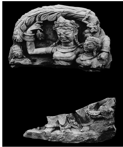
Figure 13 Fragmented Grey Limestone Stupa, Pandrethan; Lumbini Garden Scene, Top Portion 35 42 Cm, SPSM No. 1854; Bottom Section 25 38 Cm, Second Quarter of the 7th Century CE.

Figure 14 shows a dancing partial Mother Goddess sculpture with two arms, most likely Kaumārī . In a more twisted position than the Pandrethan females, the left leg of the image is lifted and equilibrums on the right leg with the hip push outward and the. Unfortunately, the breasts and face have been removed, along with the swollen stomach, which must be a sign of pregnancy. The decoration closely resembles the style of late sculptural art from the advanced stage of the determinative period, even if the posture shows an original post-Gupta expression. Originally, the uplifted right hand detained up a collection of elongated hair strands that were falling from overhead the right ear, two of them curled round the lower hand. A careful inspection of the sculptures reveals that there was another workshop operating at the same time as or perhaps earlier than the Pandrethan sculptures Mitra (1977) , producing extremely intricate and high-quality work, showing yet additional facet of post-Gupta skill.