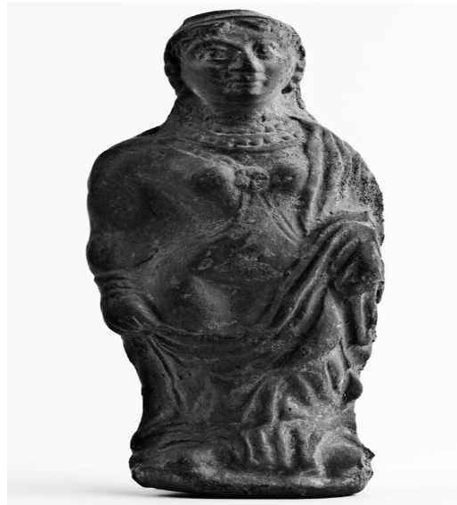
Figure 3 The Terracotta Female Tutelary Model (9.7 Cm), From Semthan, 1st Century BCE or 2nd Century CE (Personal Possession)

A mithuna Figure 4 is a well-crafted piece that is closest to the Indian aesthetic, despite the fact that certain aspects are treated in a way that is similar to figurines in the Hellenistic style. The female among them adopts a posture resembling that of yakṣī in early Indian painting, standing with her crisscrossed ankles and her left foot elevated behind her right. The right hand is in the abhayamudra . position. The female attires a long sarong with many, small folds that end at her ankles, and another garment over it that ends just below the knees. A bejewelled torque, on the left arm the decorated bangles, and a number of trinkets in her neck are worn by the woman. A possible domed reliquary is supported by one of the neck-jewels, which hangs diagonally from it to her right hip. The thighs are covered in a double-stranded girdle that is gripped by the dropped left hands in the style of the yakṣīs as shown in the ceramic panels from the Sunga era at Candraketugarh, Mathura and Kauśambi Mitra (1977) . She is looking at the man with her head cocked and her hair in a big bun. A long, pleated paridhana with zigzag folds around the edges is worn by the male and hangs amid the legs in a bunch of elongated, pointy ends. A thick belt with short ends that fall down the thighs and a knot in the centre secures it at