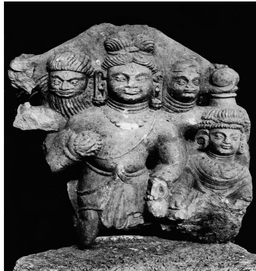
Figure 9 Standing Mother Goddess with Four Arms Made of Grey Chlorite, 62 Cm High, Bijbihara, 3rd or Last Part of the 5th Century.