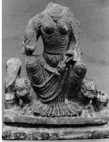
Figure 11 Lakmi Sitting in Broken Grey Chlorite, 10 Cm High, Sheri, Baramulla, Second Part of the 6th Century CE.

The Lakshmi from Sheri, Baramulla Figure 12 is an extended version of the grey chlorite Lakshmi group Figure 11 , which depicts the lustrated god seated in pralambapādāsana . In terms of the modified Hellenistic clothing Pal (2003) and Pal (2007) , it is comparable to the later, but the tucking is more real, and the upper costume is frilled unevenly, revealing the right side of chest without a pattern. The lower dress also bears this unusual treatment, especially above the hidden feet. The jewellery includes simple armbands, double bangles, earring studs, a necklace, and a pendant. Right hand raised, palm outward, gripping the petite lotus stalk between the index finger and the thumb. The animalistic end of a fully transfigured cornucopia, which dispenses diamonds, is held in the left. It consists of a long, folded-over stem that is growing leaves and holding a decorated vase. The appearance is broad in relation to the body and has a pointed chin. The hair is held in place by a gut with three crescents, the central one is spoiled, and is styled in twisting curls with elongated tresses enclosing the ears.