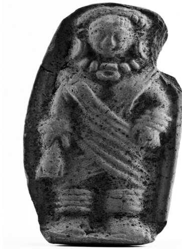
Figure 1 The Private Collection from Semthan, Terracotta Fragmented Hellenistic Female Sculpture (10.5cm), First Century CE

A rare instance of the semi-dressed style image is kept in a personal custody Figure 2 . It is similar to the fully draped kind in most ways, but the figure is nude from the shoulders to the tops of the legs, with the visible hip and right shoulder being particularly prominent. There is also no chiton . The features of the face are the similar, but the hair is curly and has a fillet, that has been parted along the brow. Similar to the himation , that falls down on the right thigh and the left leg is somewhat arched. A short-beaded necklet, a torque with two ribs made of beads, and crossbands, or channavira , are also present. The later item contains a medallion with a rosette design between the breasts that connects the four cords, with the lowest pair being longer.