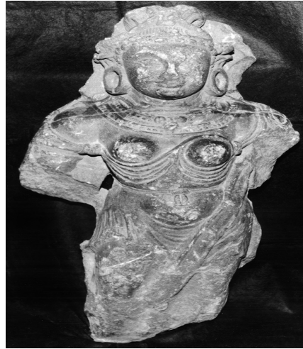
Figure 10 Upright Maheshvara and Uma in Greenish-Grey Stone, 50 Cm High, Ushkur, 6th Century CE.