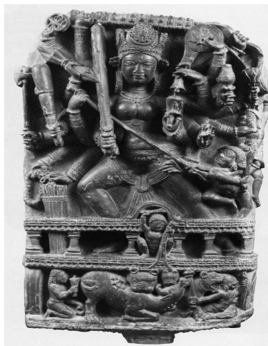
Figure 17 The Durga Mahiṣāsūramardīnī Bas Mural is Greenish Chlorite and Is 68.6 Cm High.