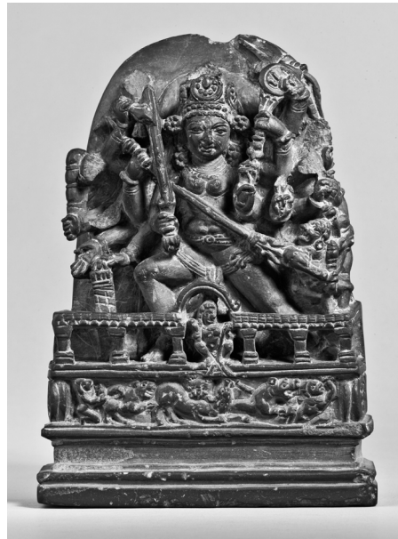
Figure 18 14.3 Cm Tall, Grey Chlorite Tiny Bas Panel Showing Durga Mahiṣāsūramardīnī with 18 Arms, Personal Possession, 900 CE.

The Metropolitan Museum has a bigger green chlorite upright silent version of Durga with two servants Figure 19 Siudmak (2013), Chandra (1985) . As she stands here, she is slightly backed on left foot. The inside of the left hand sustains the contrapposto, the weight of the severed buffalo head, in the exact same way as Vishnu holds a shankha . While the right is dropped and holding an upright sword, the outer left is dipped and retaining a bell with flexing strings of ribbons. She is wearing a complex ensemble with pointy trilobed ends and slit kameez dresses as well as jewels visible above the beaded girdle, with the front flap. It has a similar form to those already seen, covers the stomach and upper thighs, and has beading on the hem. The breasts are compressed by a short overgarment that is tied securely around the waist.