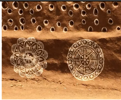
Figure: 1 Mandana motifs on Wall