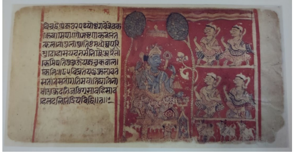
Figure 1 A folio from Bal-Gopal-Stuti .