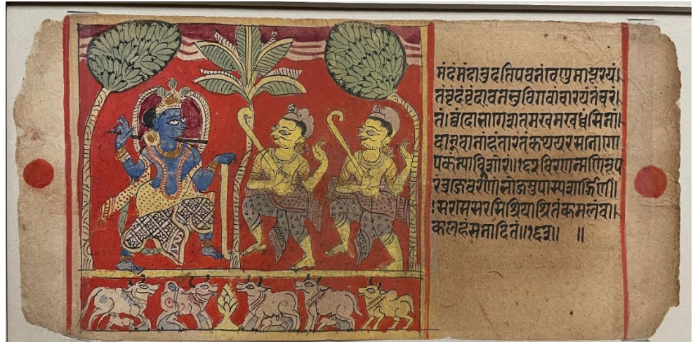
Figure 6 A folio from Bal-Gopal-Stuti .