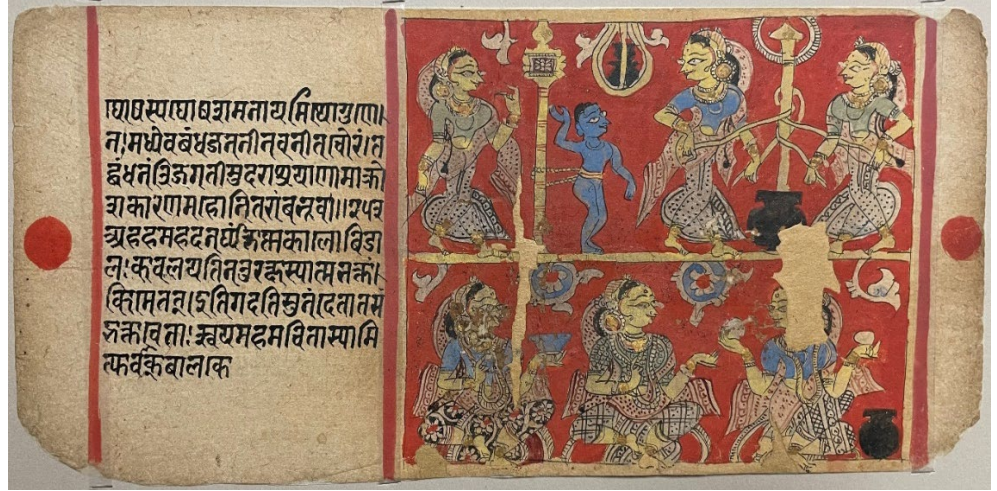
Figure 5 A folio from Bal-Gopal-Stuti .