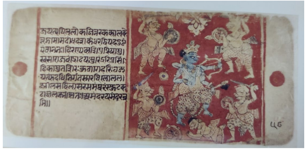
Figure 3 A folio from Bal-Gopal-Stuti .