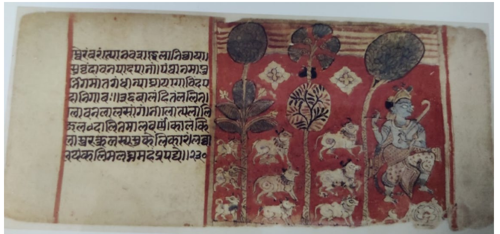
Figure 2 A folio from Bal-Gopal-Stuti .