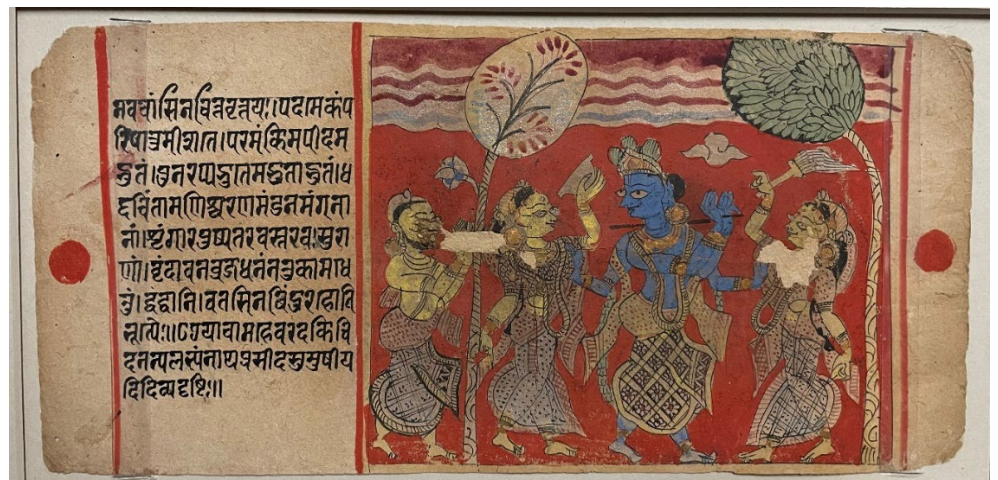
Figure 4 A folio from Bal-Gopal-Stuti .